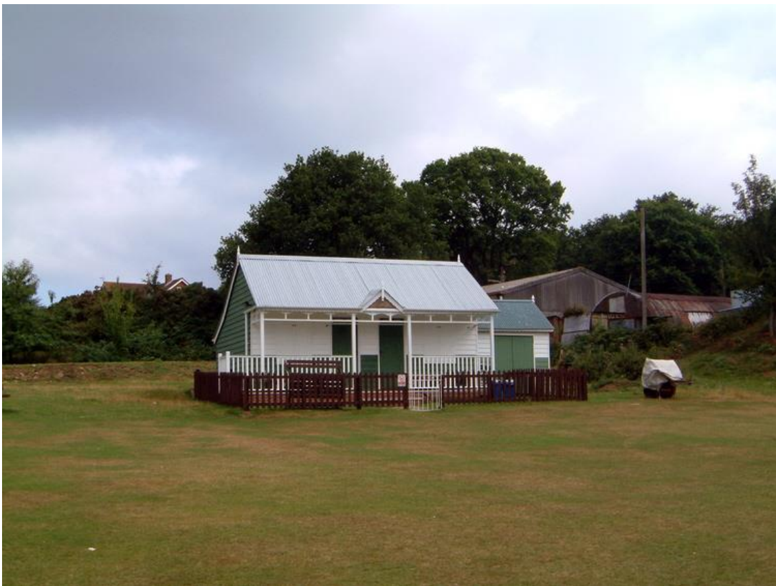
The pavilion has been renovated and extended since 2000. Date taken - August 2009

View direction - North West Date taken - July 2000