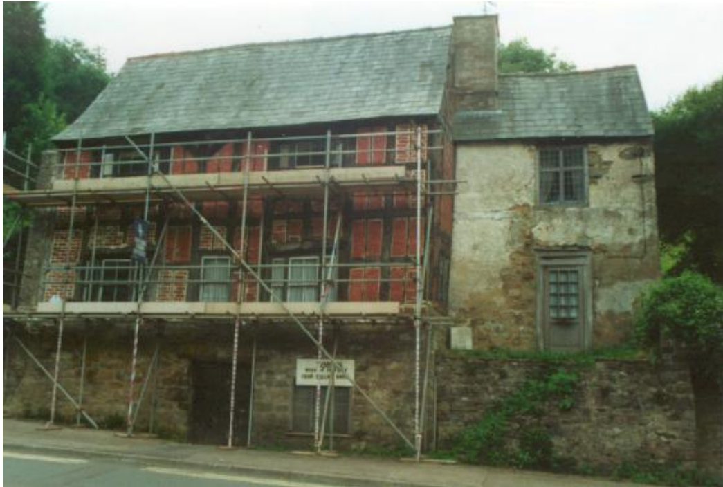
Sarah Siddon's house, Lydbrook - Reputed home of the former actress, the building dates from the sixteenth century and was extended in 1718. A Listed building at risk.