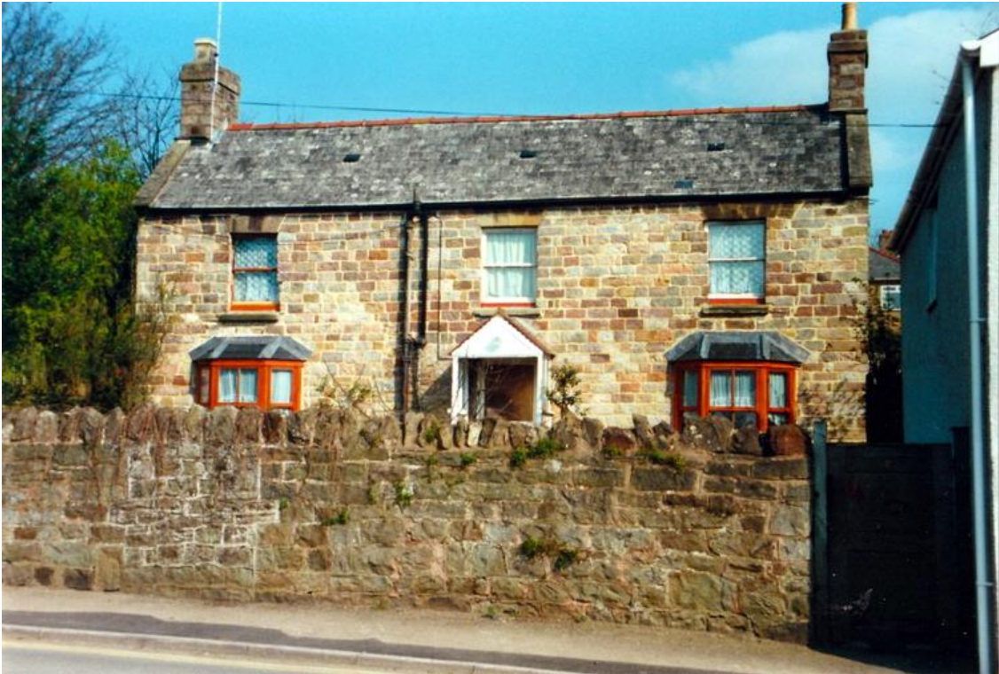
This dwelling in Heywood Road was originally Cinderford's first Police Station. Coleford Parish

Camera location - SO657142