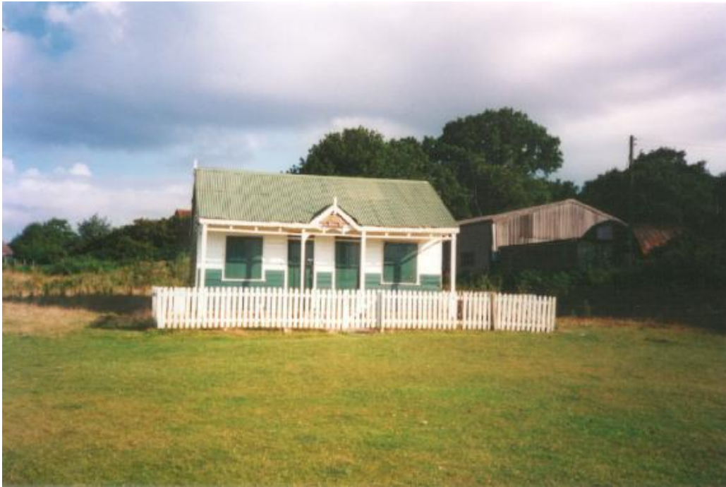
Yorkley Star cricket pavilion - Erected 1937, situated on 'Cut and Try Green' Oldcroft West Dean Parish

Camera location - SO645067