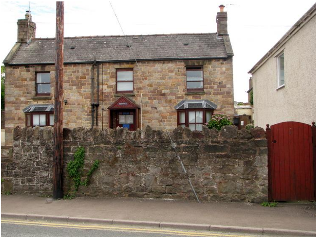
Some minor changes, the building is now a Veterinary Surgery.

View direction - East Date taken - April 2000