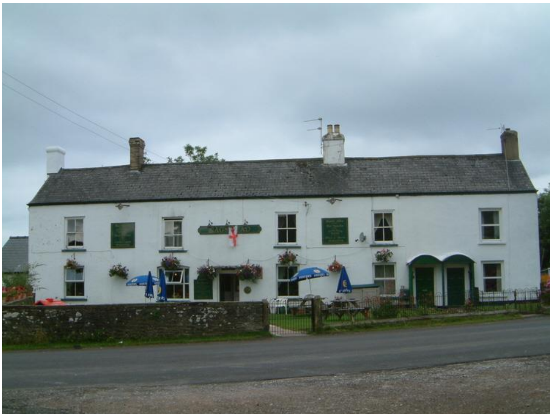
The slight change in viewing angle is slightly misleading as there have been few changes other than a new colour scheme.