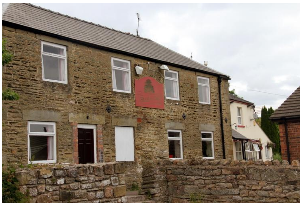
The original building shows few changes.

View direction - North West Date taken - August 2000