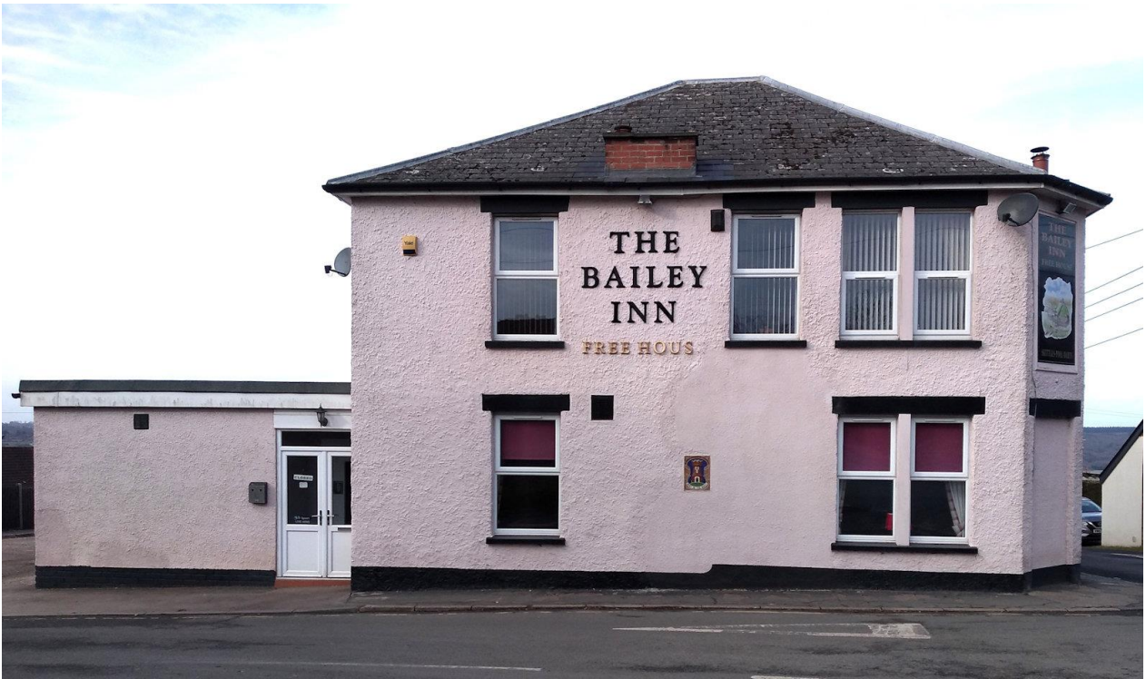
September 2022, some decorative changes noted Date taken 29 th September 2022