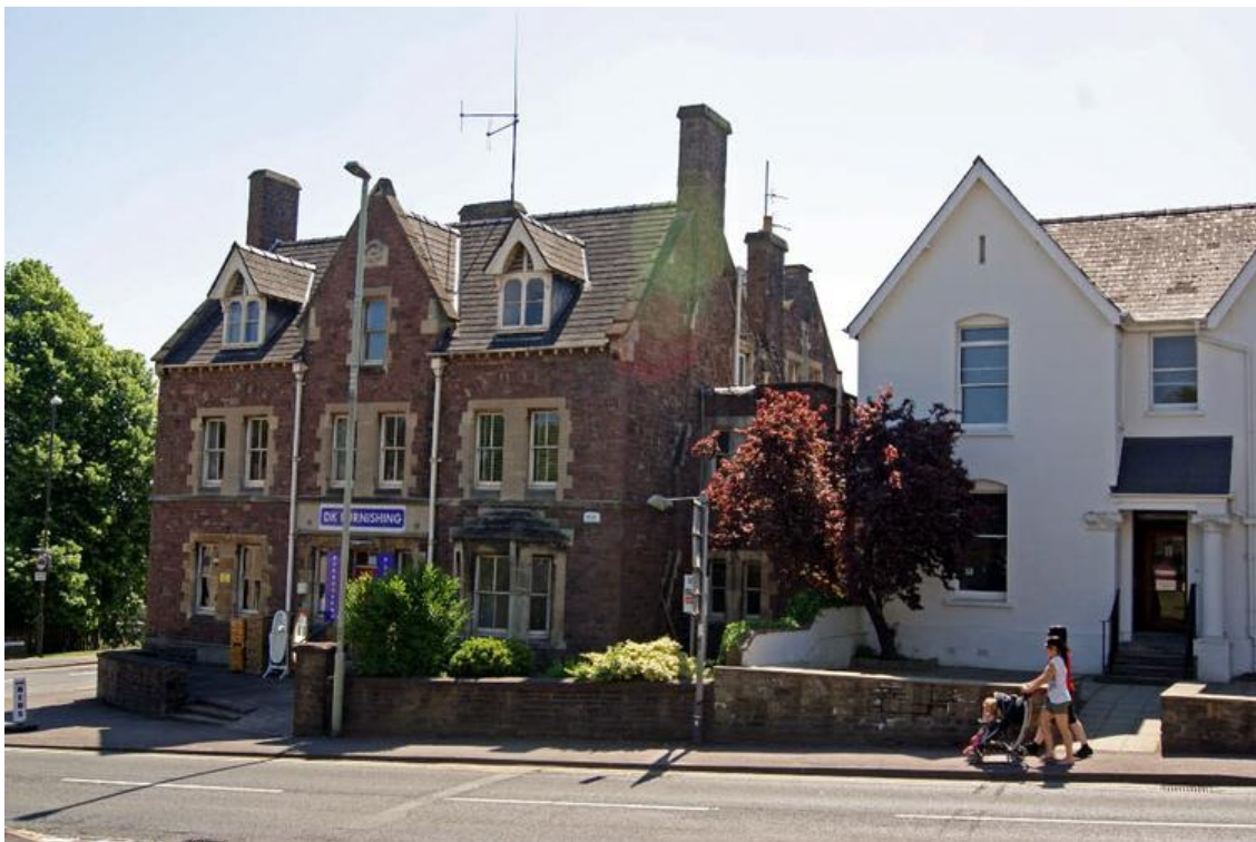
The building has changed ownership but the external appearance has been preserved.

View direction - South East Date taken - June 1998