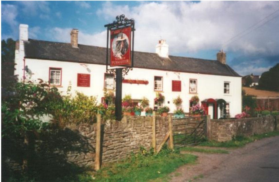
Nags Head public house, Yorkley - Had opened by 1788, situated on Oldcroft Road. West Dean Parish