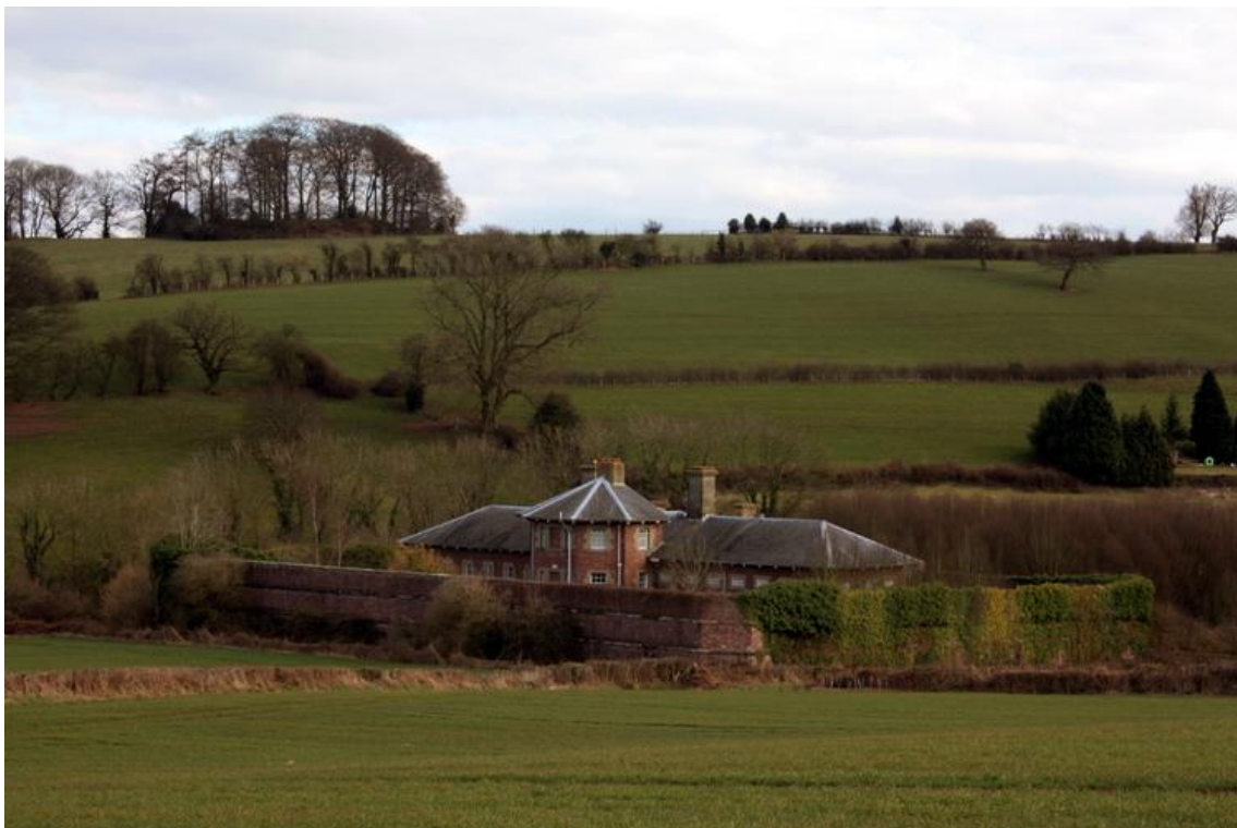
Little change can be seen although the gaol has recently been used as a museum.