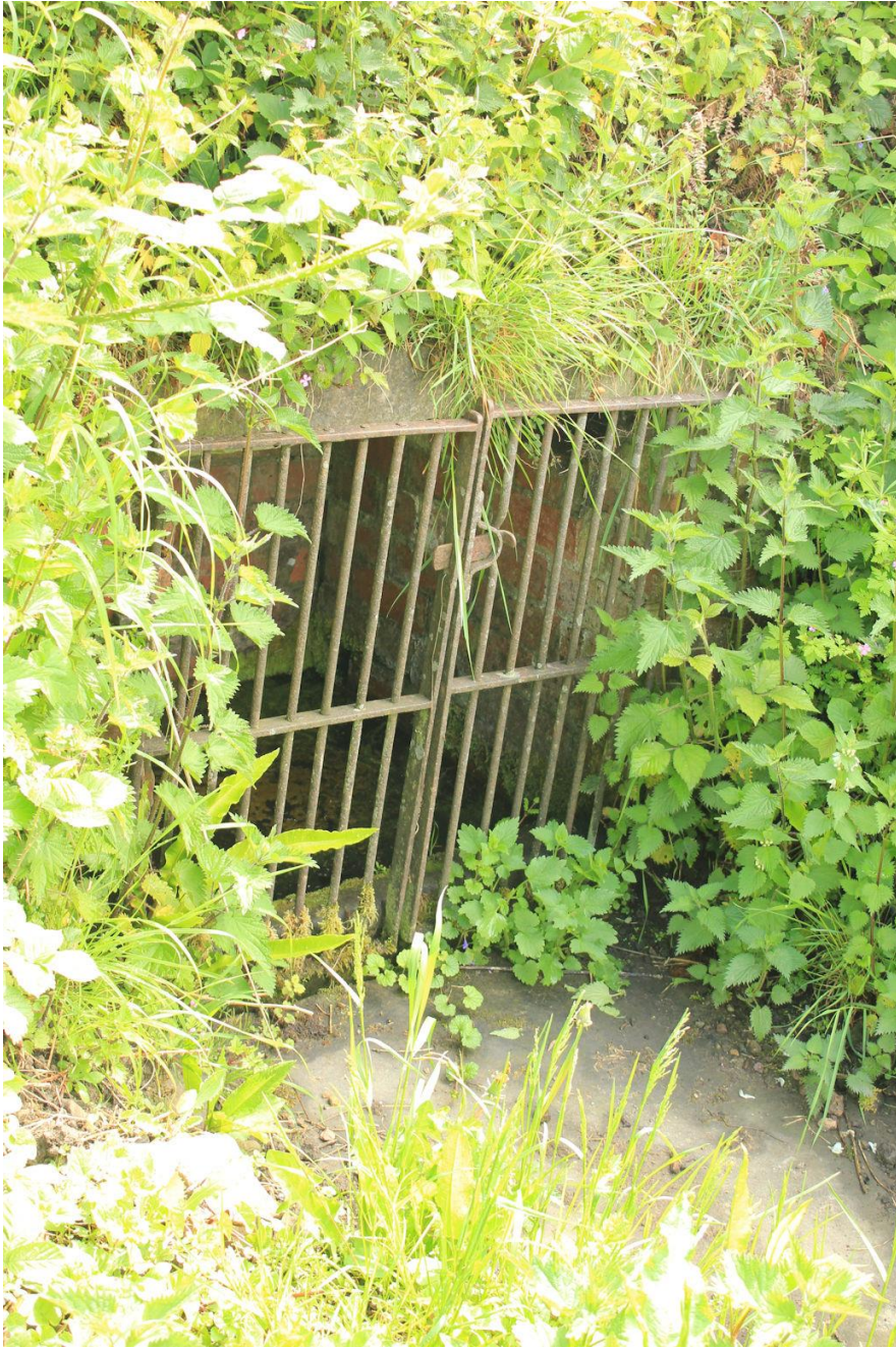
Difficult to locate and overgrown with vegetation in 2022.