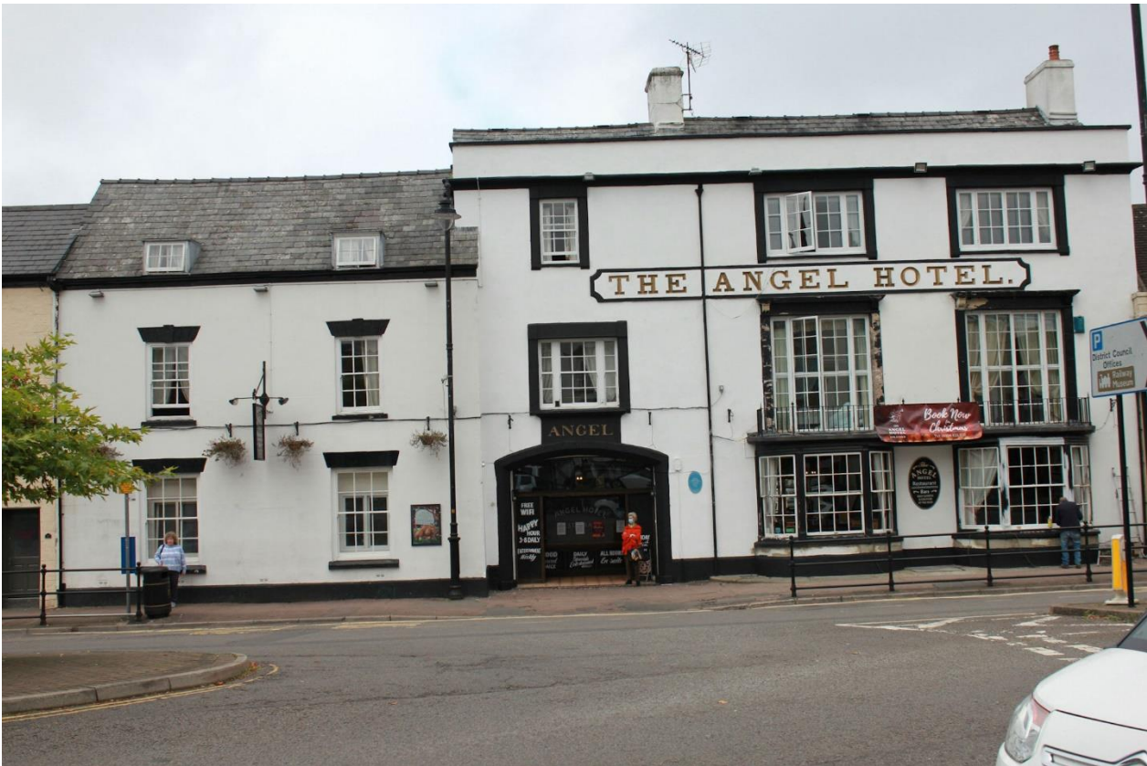
In October 2021 only decorative changes were observed Date taken – 7 th October 2021