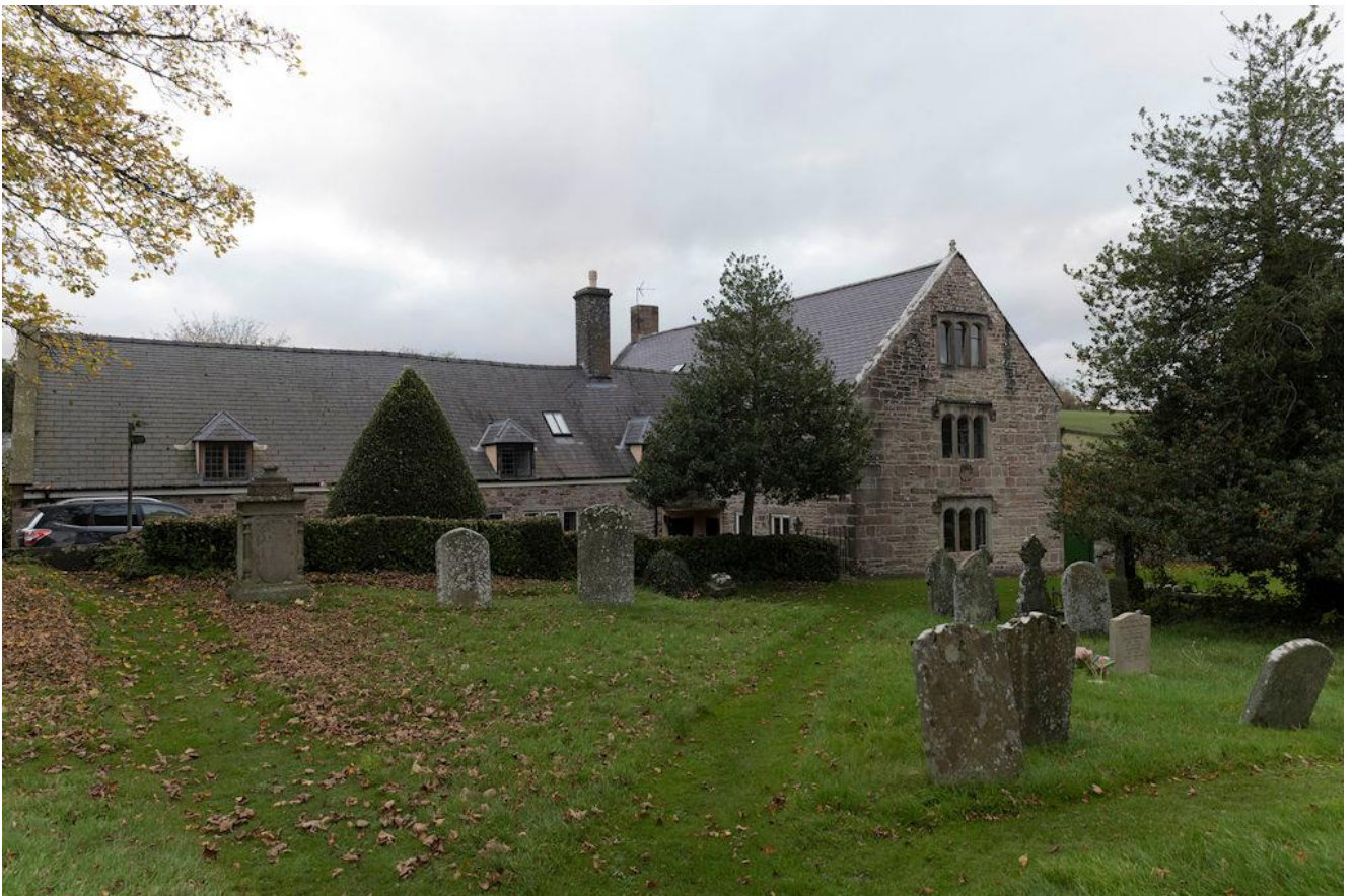
Alternative view shows general situation adjacent to church grounds in 2021 Date taken 19 th November 2021