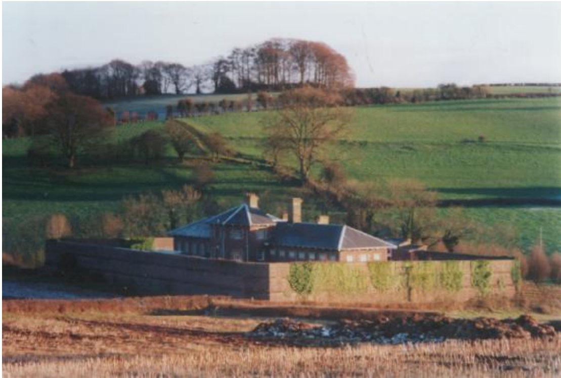
Littledean Gaol and Camp - Circle of trees shows 'Old Castle of Dean' (Motte and Bailey, probably wooden 'castle' c11/12 century).