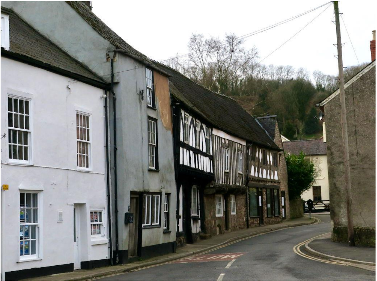
Much the same in 2023