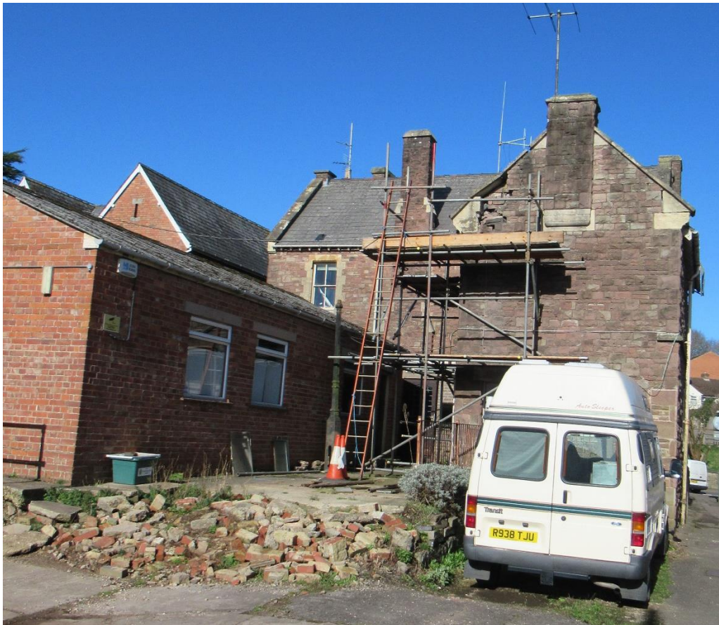
However, the rear view shows some structural issues, remedial work was completed by 2024