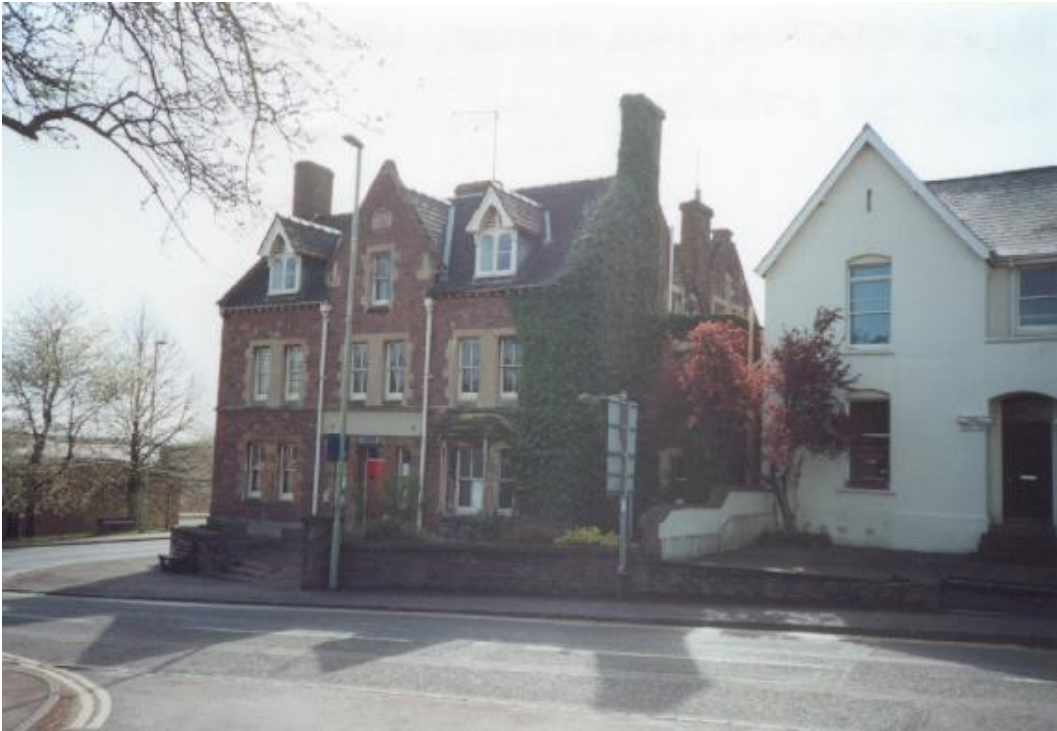
Lydney Police Station - Built 1876. Also housed Magistrates Court until c1980 . Still in use as Police Station but under threat in 2000.