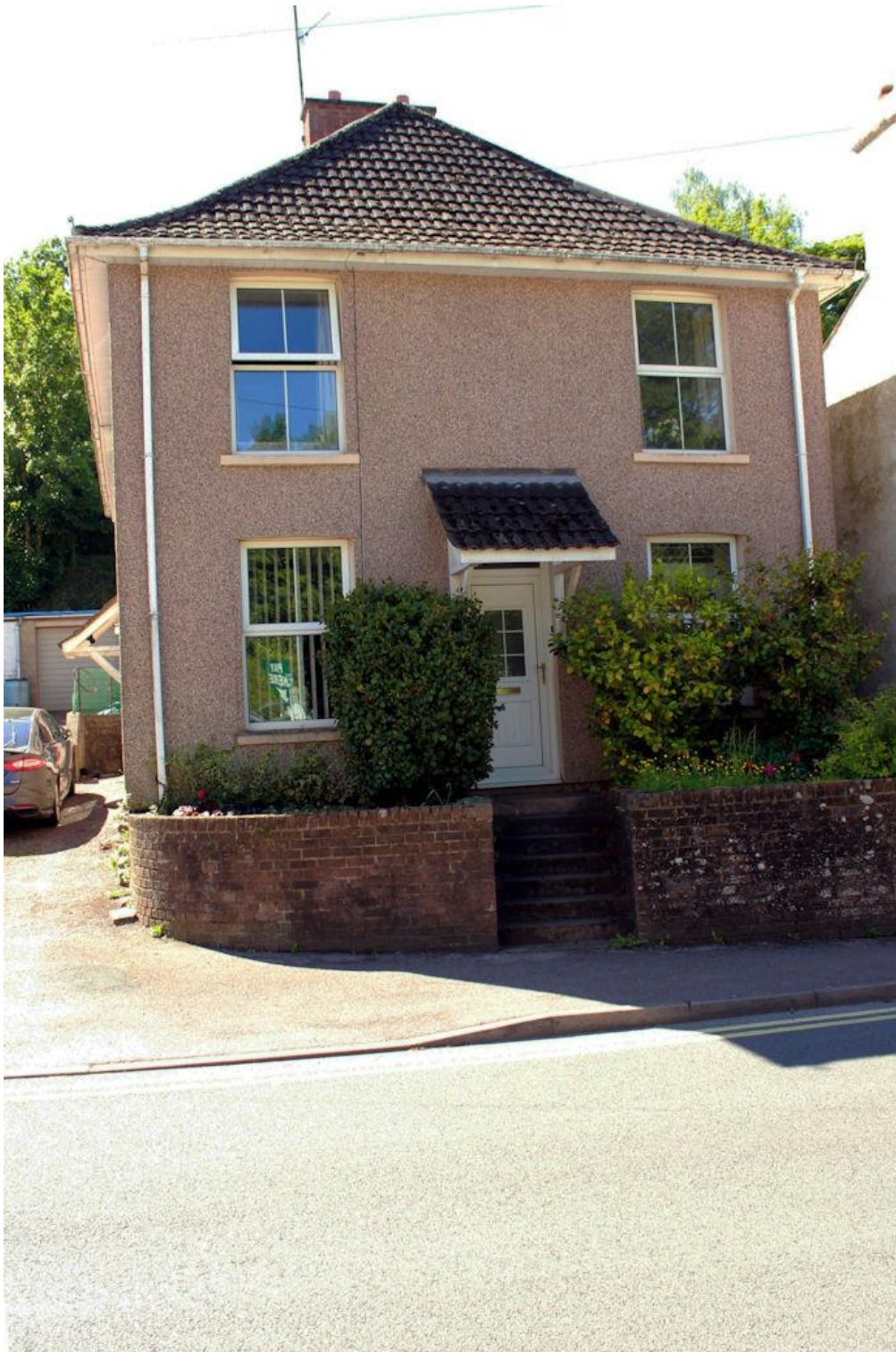
Shows some decorative improvements and maturing vegetation.