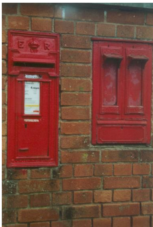
Edward VII letterbox and stamp machine base, Clearwell. Newland Parish

Camera location - SO571082