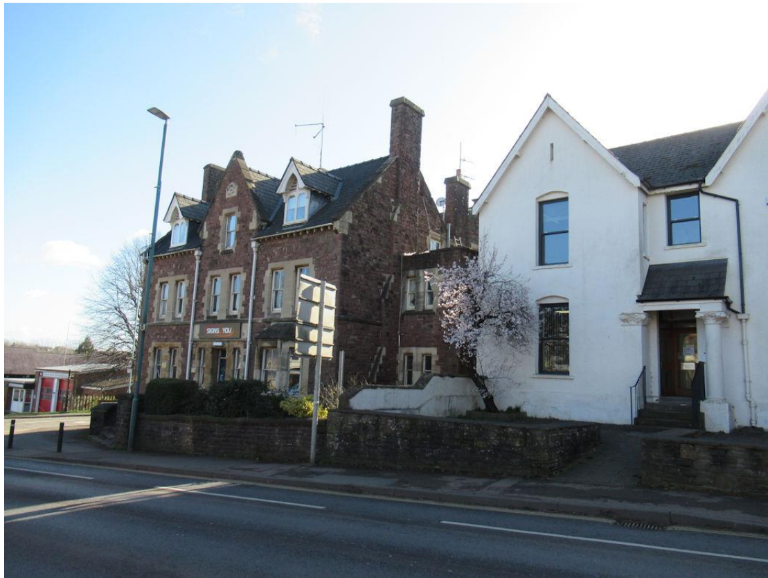
Little changed from the front view in 2022.