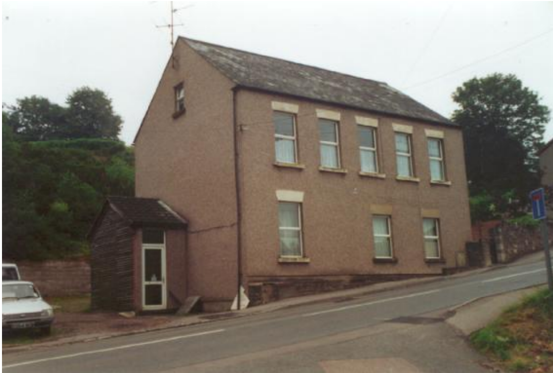
Cinderford's earliest Co-op – Now a dwelling, formerly an off-licence, probably Cinderford's first Co-op, built by local workers in 1874.