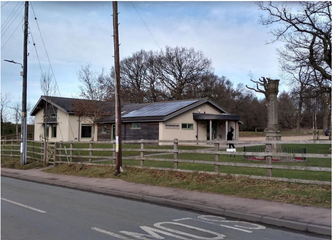
Yorkley Institute was demolished and replaced by Yorkley Community Centre which opened in 2015.