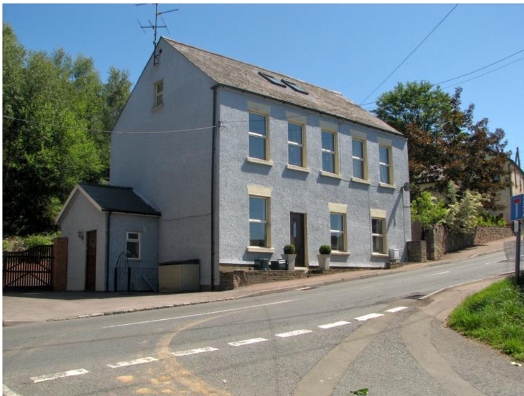
Minor modifications and redecoration since 2000.