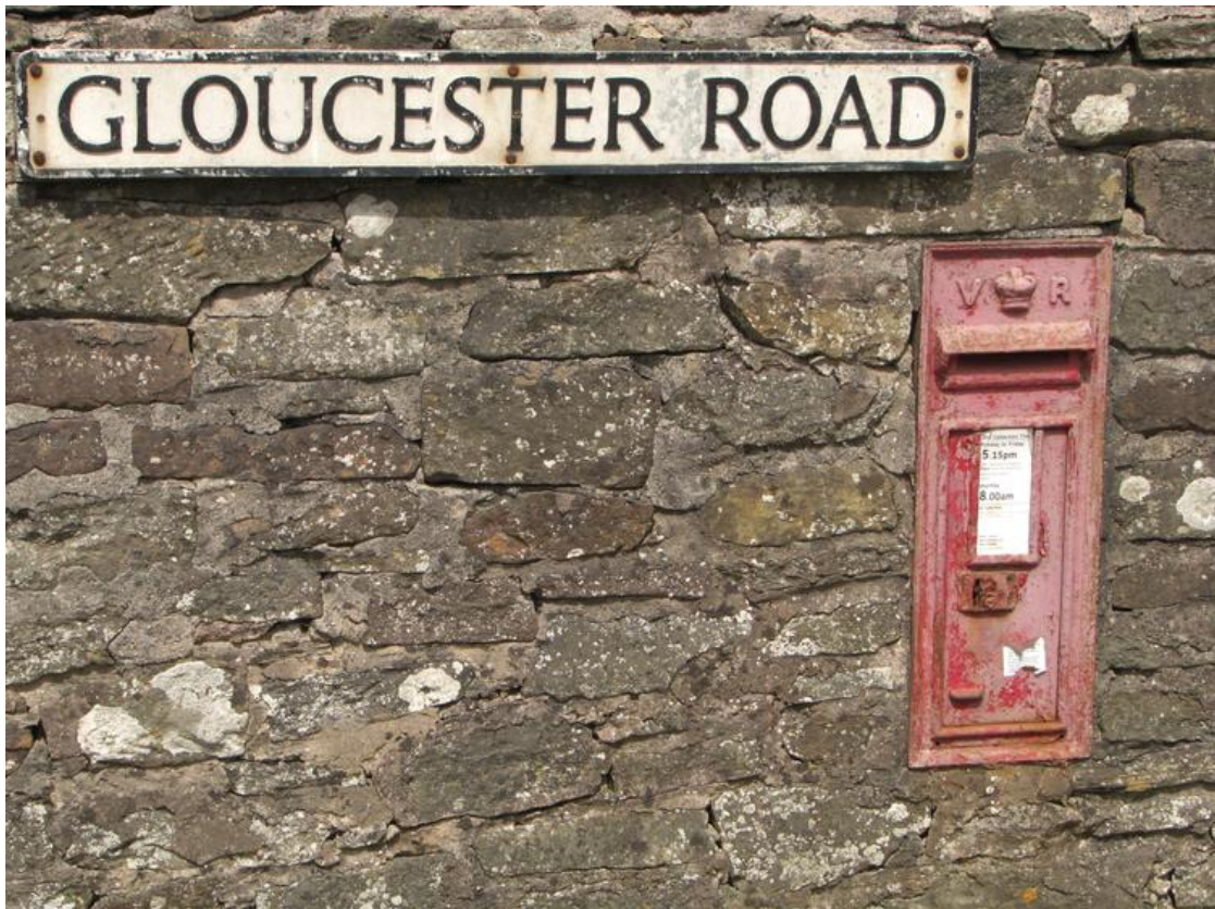
The paint has faded, otherwise the letterbox is still intact.

View direction - North West Date taken - May 2000