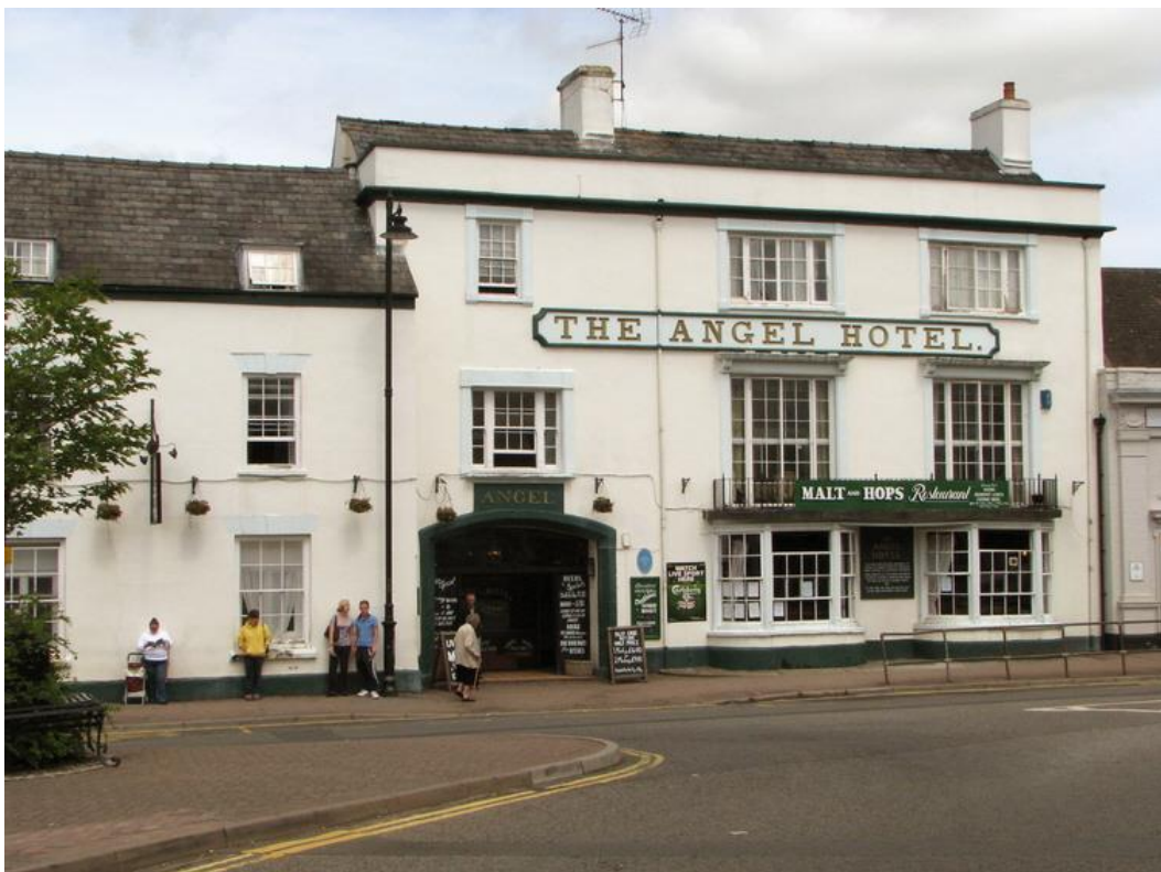
The Angel Hotel shows few changes apart from decoration.