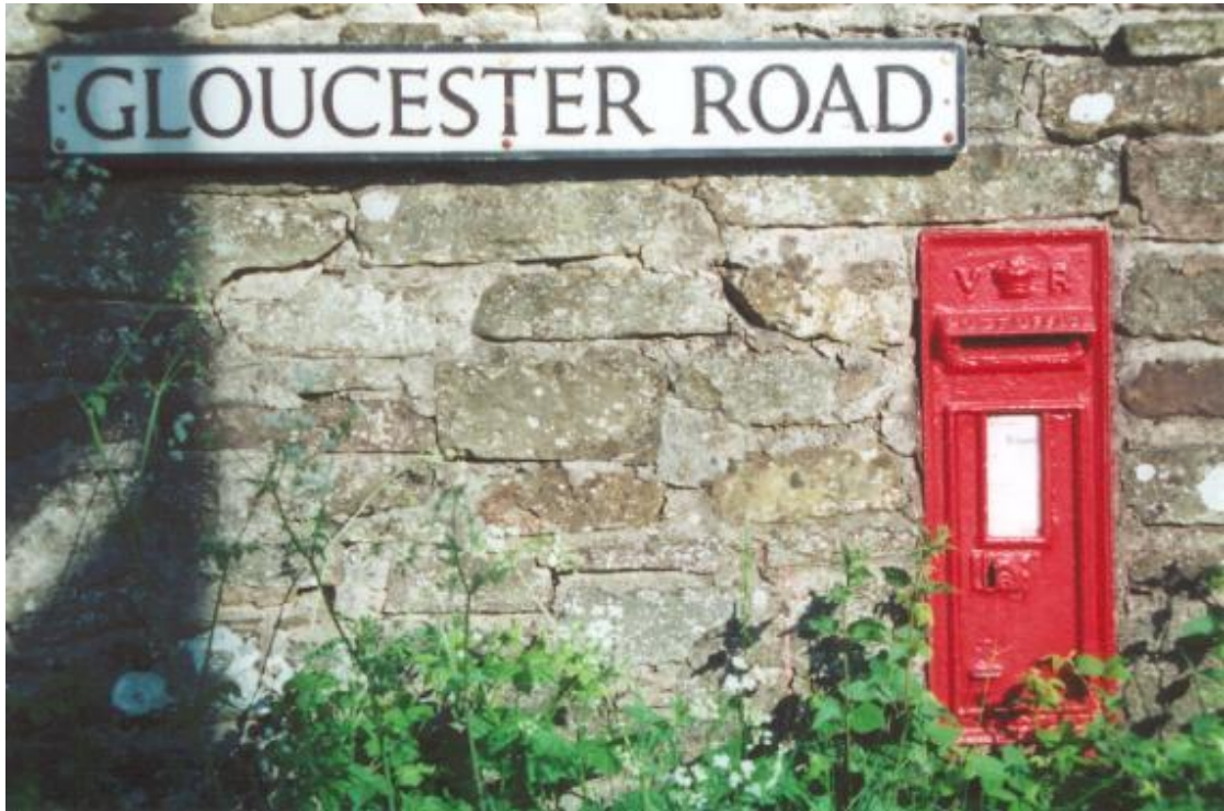
VR Letterbox, Gloucester Road, Coleford Coleford Parish

Camera location - SO581112