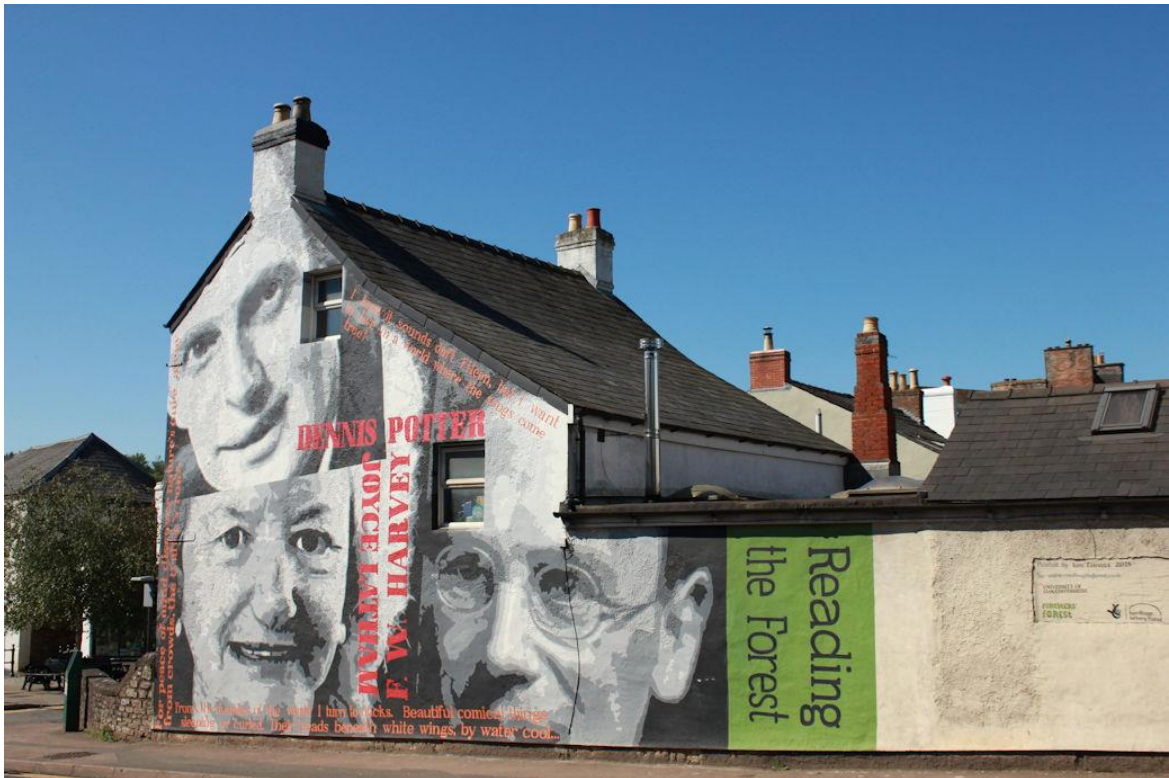
The building appearance has been improved and one of its walls now has a substantial mural featuring local authors.