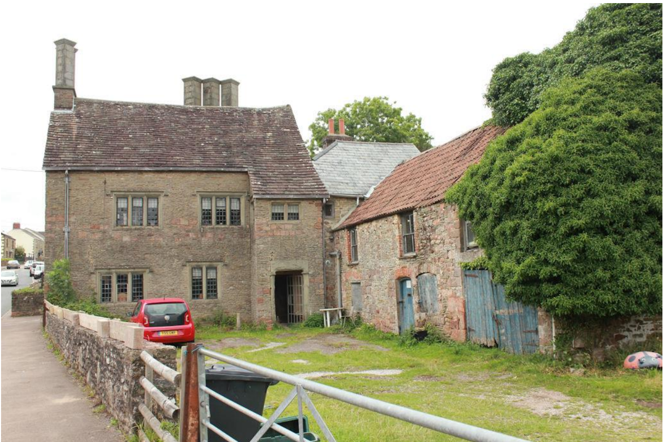
Not much change since 2010, but still occupied.