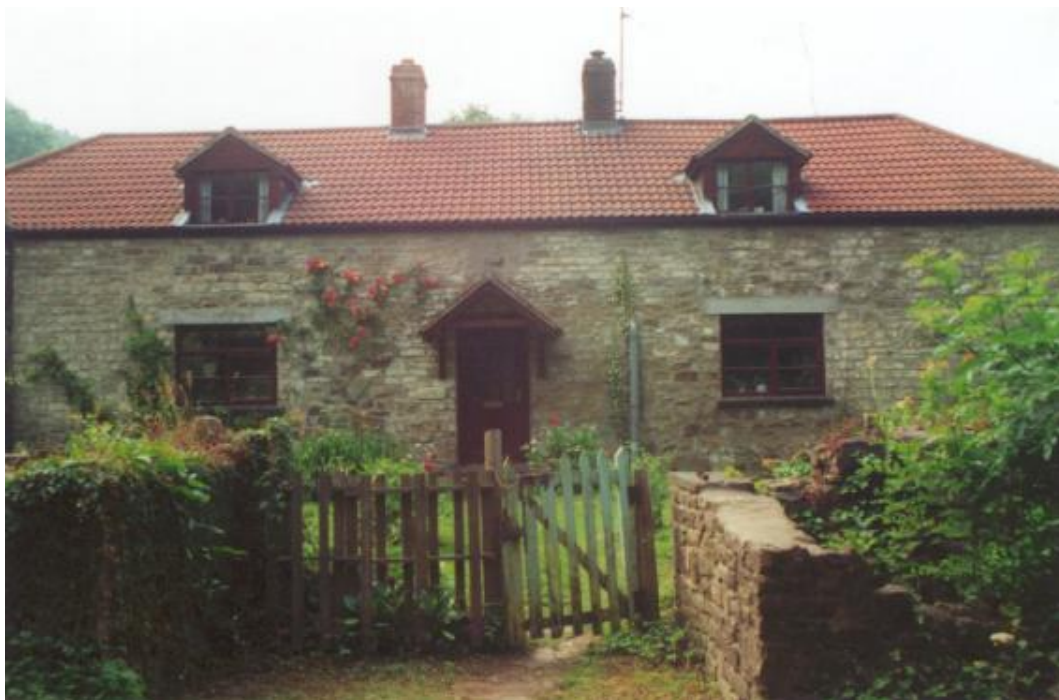
Former National School, Whitecliffe - Dates from 1820, now a dwelling (School House). Coleford Parish

Camera location - SO565099