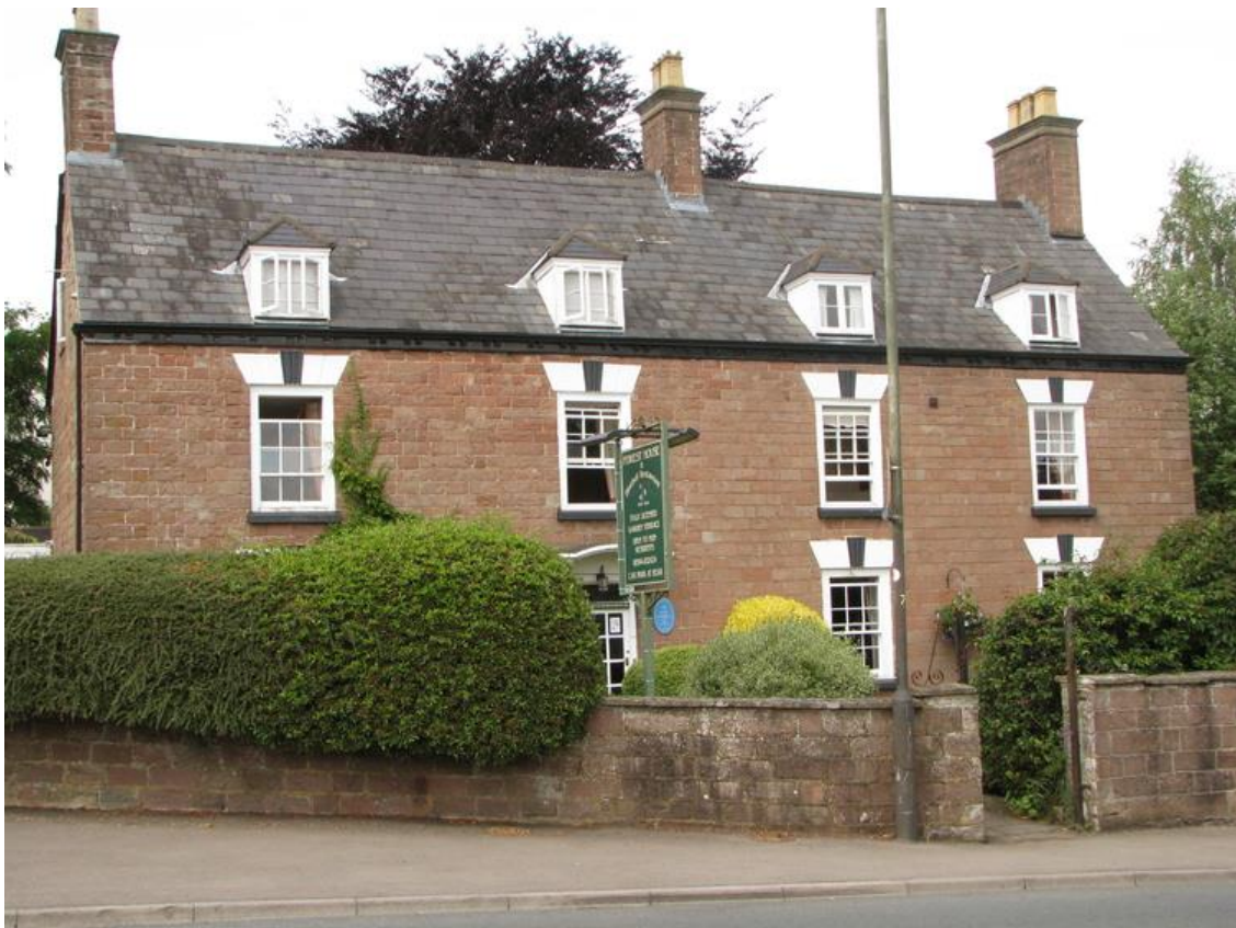
Little change is evident apart from the vegetation.

View direction - West Date taken - June 2000