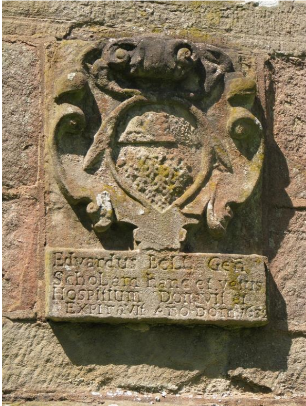
Date plaque for the original school