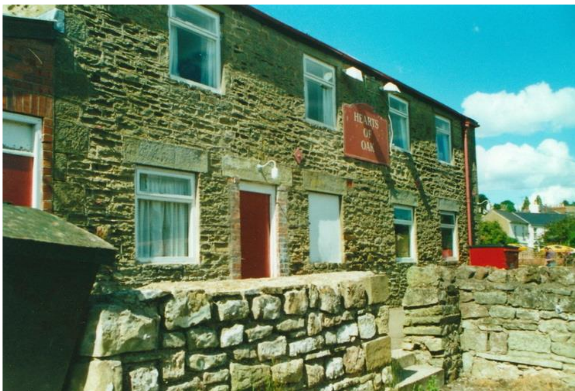
A fairly typical nineteenth century pub built with local Pennant sandstone. Drybrook Parish

Camera location - SO644174