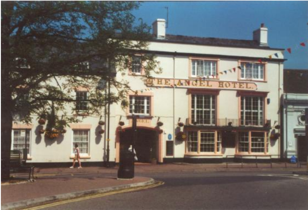
Angel Hotel, Coleford - Was an inn by 1650. The town's principal coaching inn during 18 th Century, also used for public meetings and assemblies. Still functioning as an inn in 2000.