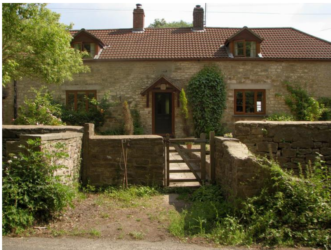
Some minor modifications to the house and surrounds but no change to the character.

View direction - South Date taken - June 2000