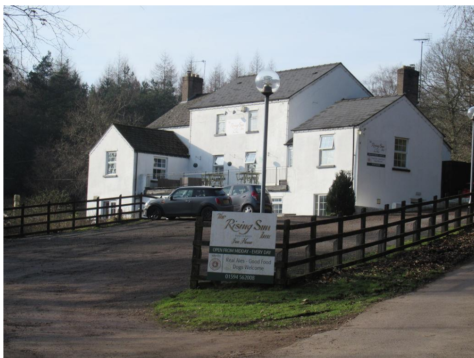
Photo taken in 2022 from a different position owing to vegetation obscuring the original viewpoint.