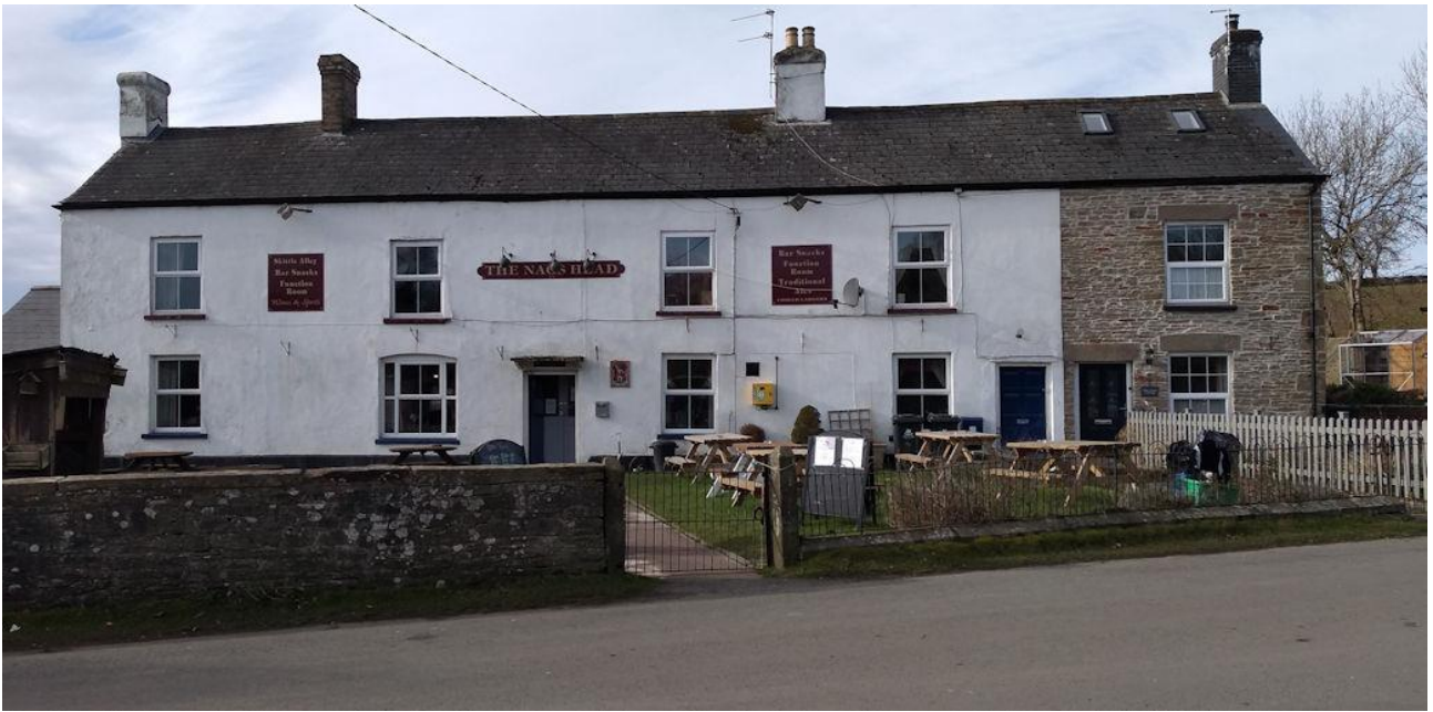
Still a public house and little change by 2022. The end property has had the render removed to reveal the original stonework.